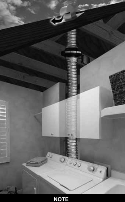
NOTE The PV-100x Dryer Booster fan is suitable for use with duct runs of up to 105 linear feet of 4" rigid duct or a maximum of 6 elbows and 80 feet.

Pressure switches are a viable method of fan activation and a good solution for many installations. The pressure switch senses the pressure differential in the duct created by the dryer operation, thus activating the fan. Conversely, when the dryer is deactivated, the pressure switch senses this differential and the fan is deactivated. S&P's PV-100xps utilizes a compact pressure sensor and run timer enclosed within the junction box and mounted to the fan housing. The pressure sensor is also available as an accessory.